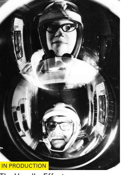
<u>The Vasulka Effect</u> by Hrafnhildur Gunnarsdóttir

Sales contact Submarine (info@submarine.com)