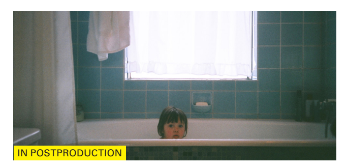
Echo by Rúnar Rúnarsson

Echo is a film where reality is captured, initiated, and staged. An echo from postmodern society, a contemporary mirror.