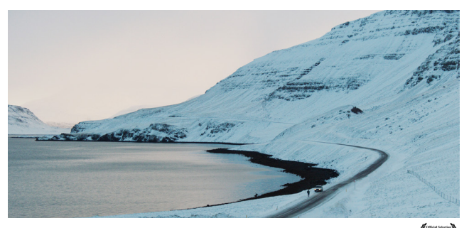
Kanari <sub>by</sub> Erlendur Sveinsson

A young couple's world is thrown upside down during a head-on collision on a remote road in Iceland.