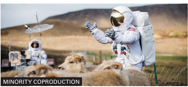
To Plant a Flag by Bobbie Peers