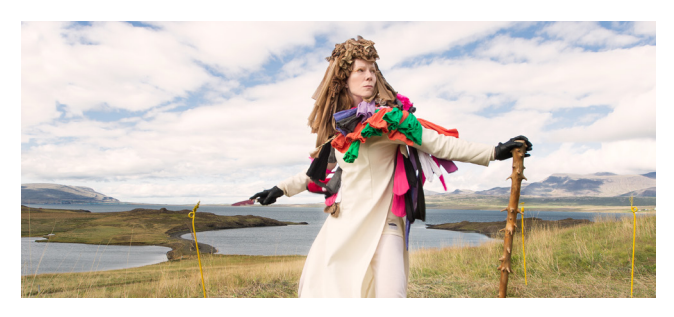
Psychography by Jóní Jónsdóttir Eirún Sigurdardóttir