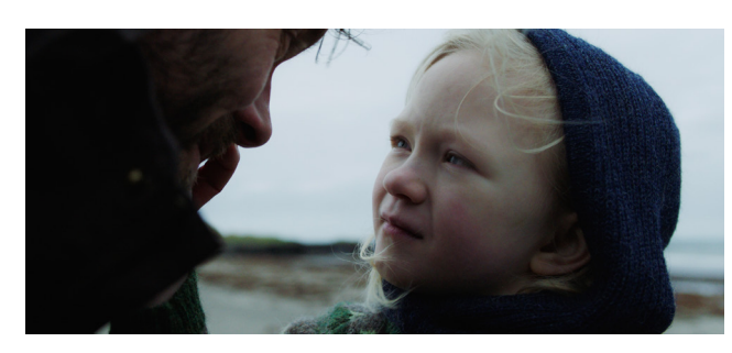
<u>Sealskin</u> <sub>by</sub> Ugla Hauksdóttir

The Icelandic Love Corporation (ilc@ilc.is)