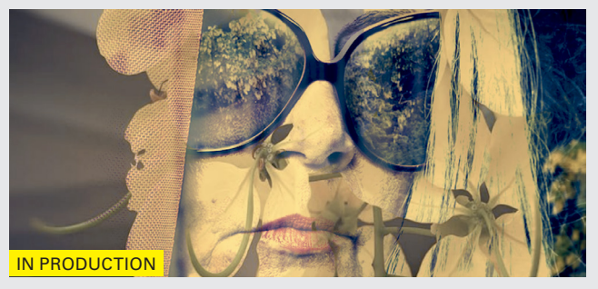
The Garden by Ragnar Bragason

International sales TrustNordisk (info@trustnordisk.com)