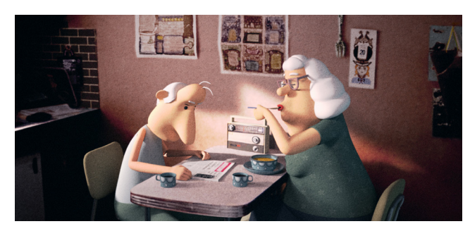
Yes People ≻minimalen 32 by Gísli Darri Halldórsson

One morning an eclectic mix of people confront the everyday battle with things such as work, school, and even washing the dishes. As the day progresses, their relationships – and ultimately their capacity to cope – are put to the test.